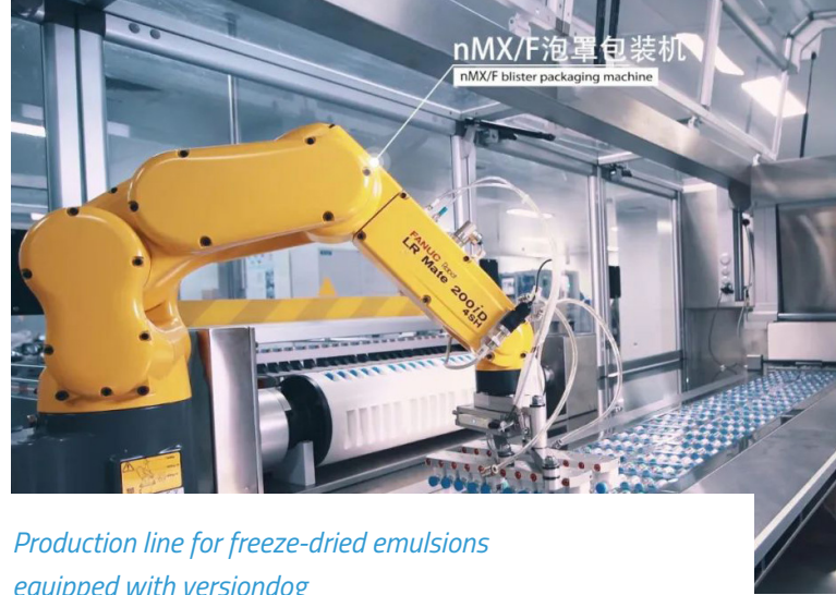
Production line for freeze-dried emulsions equipped with versiondog

From 2022 it is planned to gradually expand versiondog to all production lines in the newly built global headquarters.