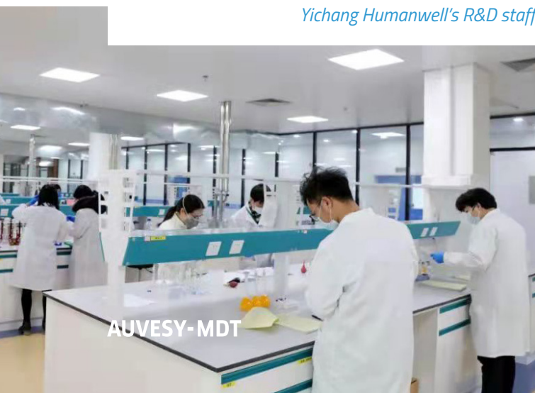
Yichang Humanwell’s R&D staff

According to Yichang Humanwell’s experience, companies that want to implement versiondog should consider three points: